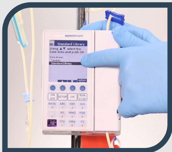
1. Select "Standard Library"