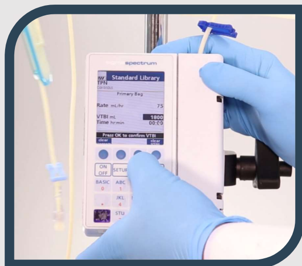
6. Enter Volume, Press "OK"