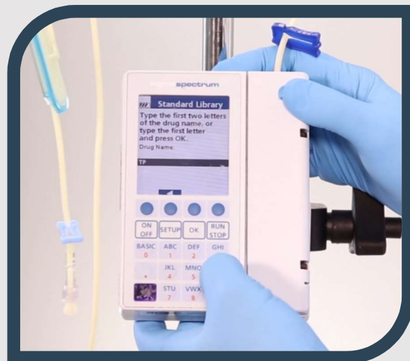
2. Type "TP" When Prompted