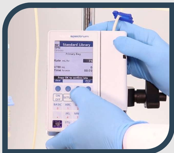
5. Enter Rate, Press "OK"