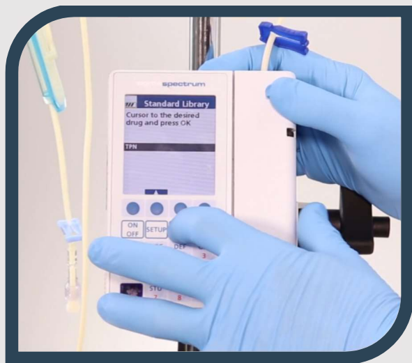
3. Select "TPN"